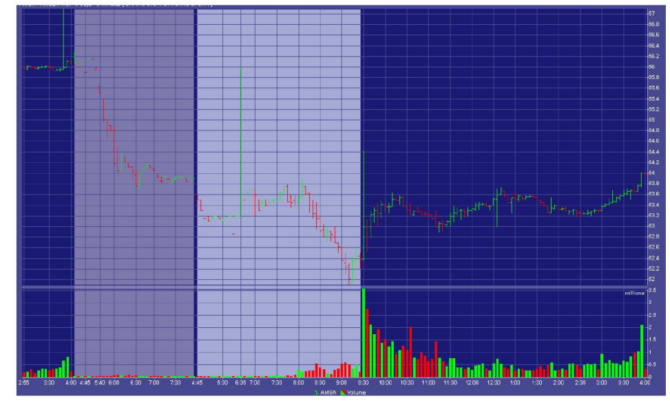
Figure 2.Amgen (AMGN)

It's not only earnings moving creating short stocks and opportunities after hours. After the bell on the evening of Monday May 14<sup>th</sup>, Amgen (AMGN) fell steadily lower following reports that Medicare was considering limiting payments for Amgen and Johnson & Johnson's (INI) anemia drugs due to safety concerns. As shown in figure 2, AMGN gradually fell 3.5% from the